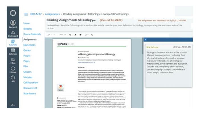
Figure 2: The Leganto Read & Respond Assignment Feature